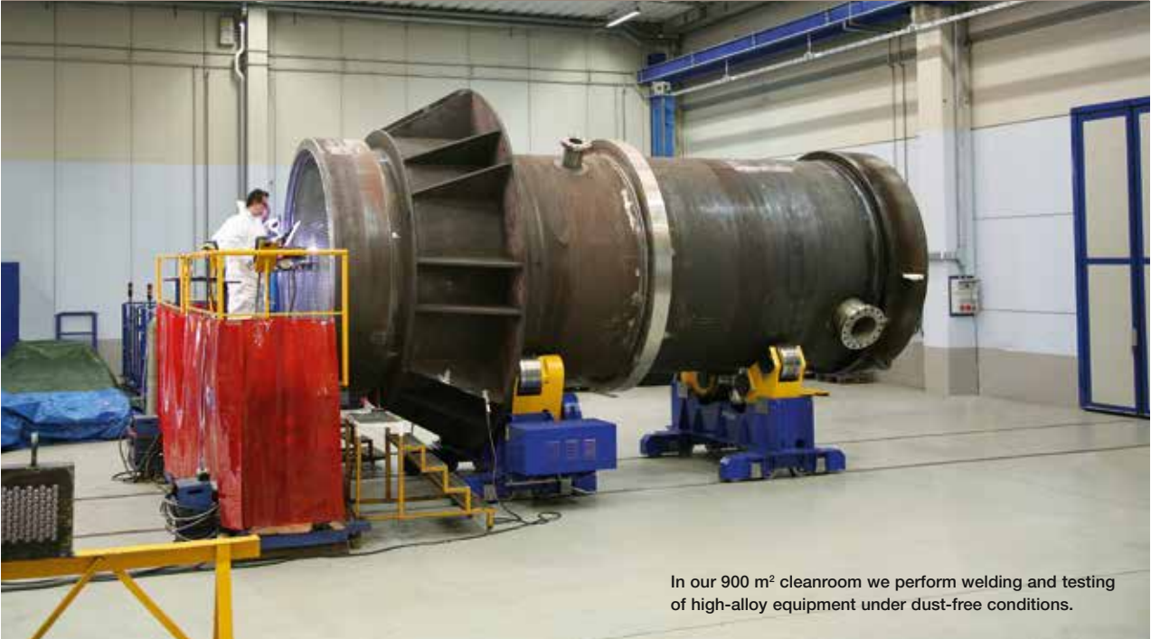
In our 900 m 2 cleanroom we perform welding and testing of high-alloy equipment under dust-free conditions.