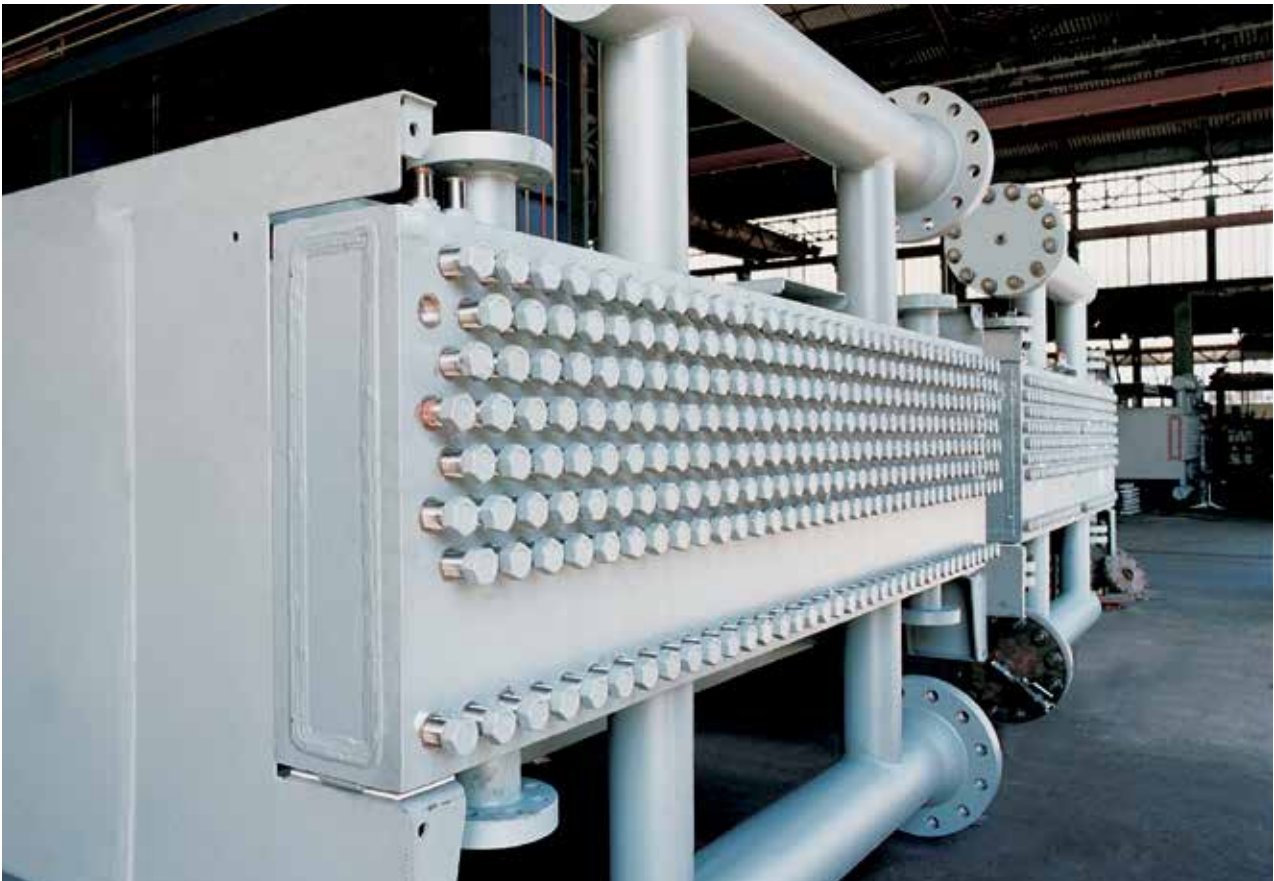
Air-cooled heat exchanger with bundles in duplex and alloy 6Mo

The design of our transfer line exchangers (TLEs) is a good example of how we create value for our customers through smart engineering. Alfa Laval Olmi TLEs have a patented design that makes them withstand the harsh conditions in quench cooling in ethylene plants much better than traditional TLEs.