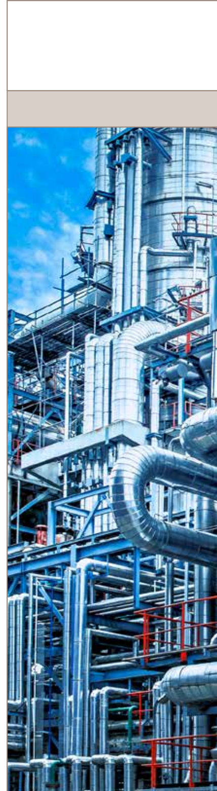
ALFA LIVAL is a trademark registered and owned by Alfa Laval Corporate AB.

Up-to-date Alfa Laval contact details for all countries are always available on our website at www.alfalaval.com .