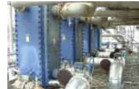
Compabloc plate heat exchangers from Alfa Laval in use at the Sarnia refinery.

In 1999, the Canadian government instituted regulations that required Canadian refiners to dramatically reduce the amount of sulphur in gasoline, down to 30 parts per million, by 1 January 2005. Shell Canada got to work early and